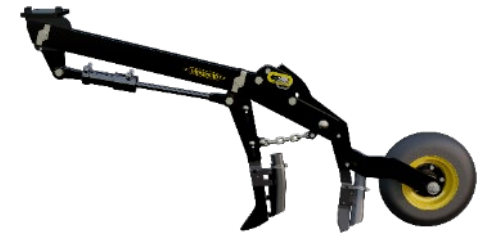
Seed Hawk opener