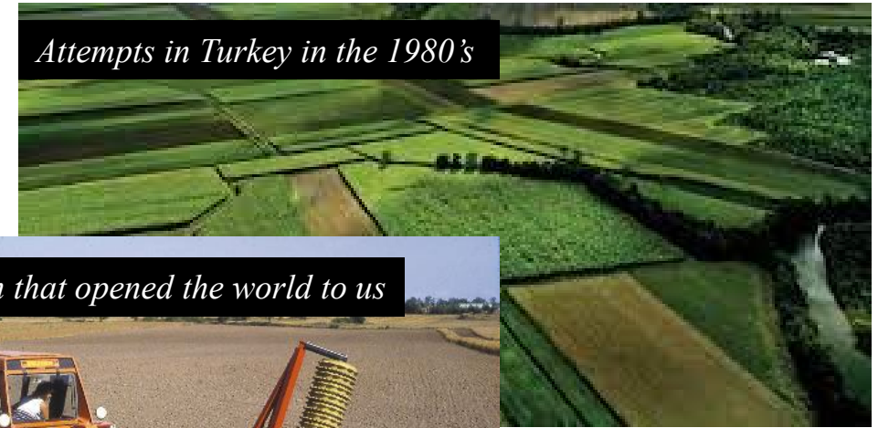
The innovation that opened the world to us