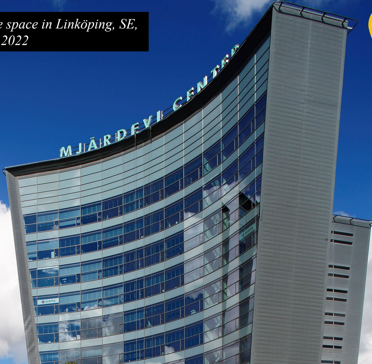
Office space in Linköping, SE, since 2022