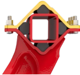
Rubber suspension disc arm