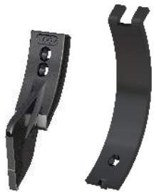
Points and shins