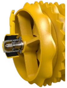
Rubber suspension packers