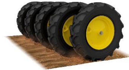
Offset wheel placement