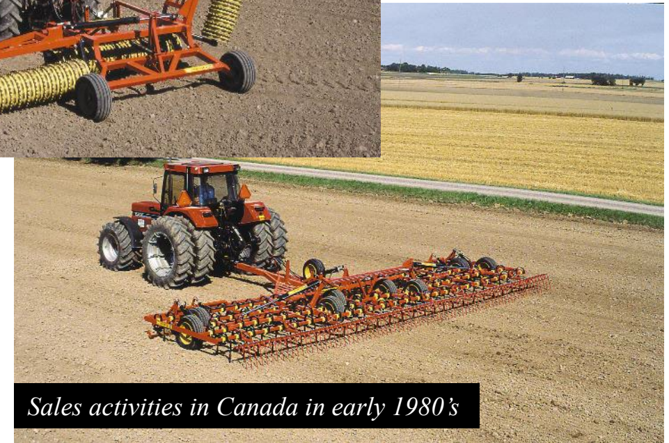
Sales activities in Canada in early 1980's