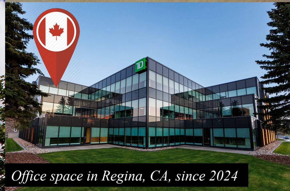
Office space in Regina, CA, since 2024