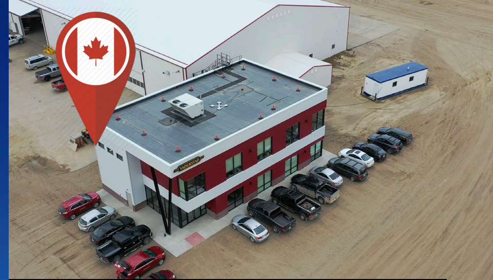
R&D office in Langbank, CA, built 2022