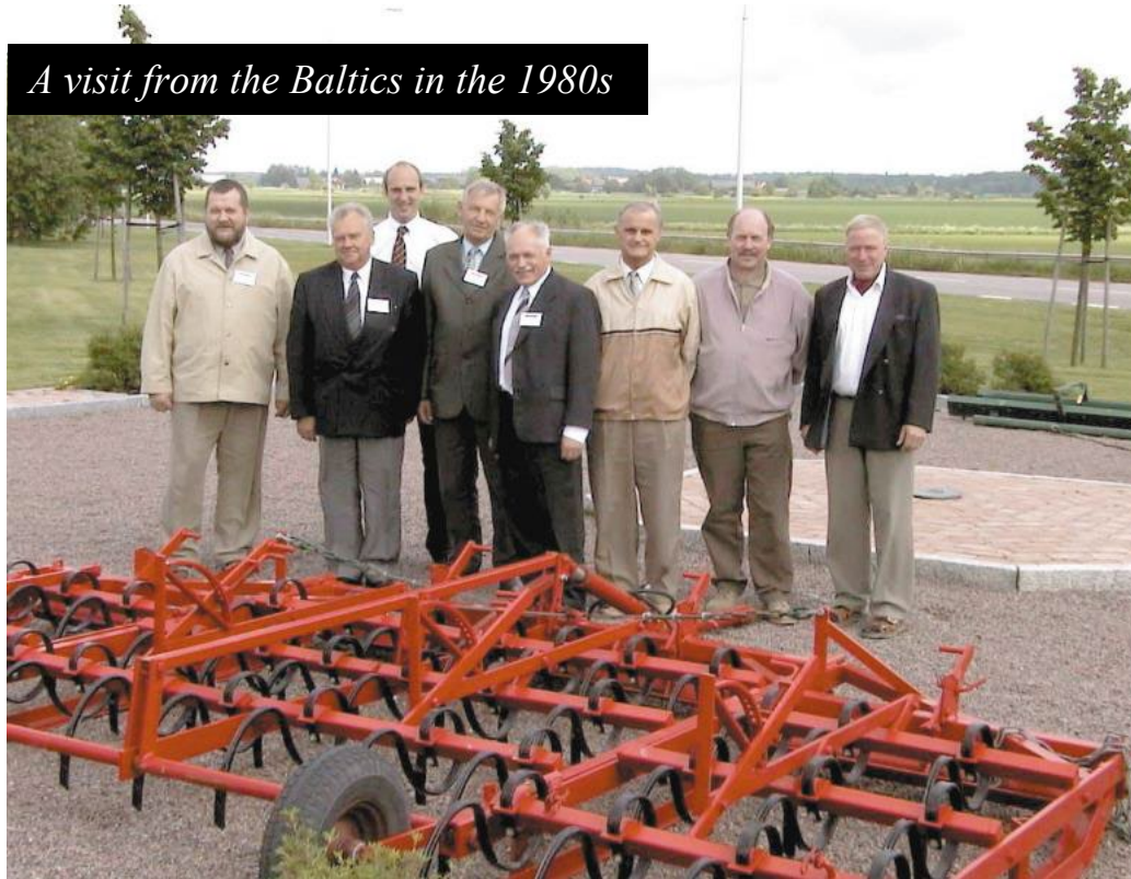
A visit from the Baltics in the 1980s