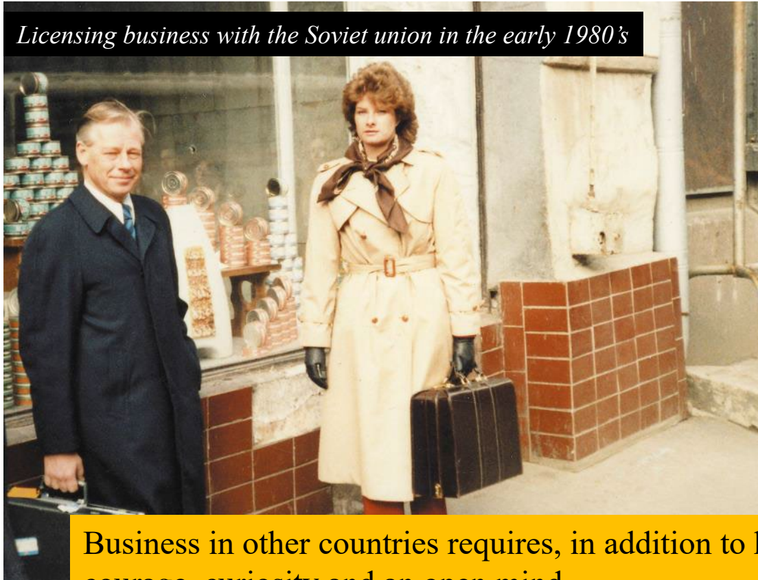
Licensing business with the Soviet union in the early 1980's

Business in other countries requires, in addition to knowledge; courage, curiosity and an open mind.