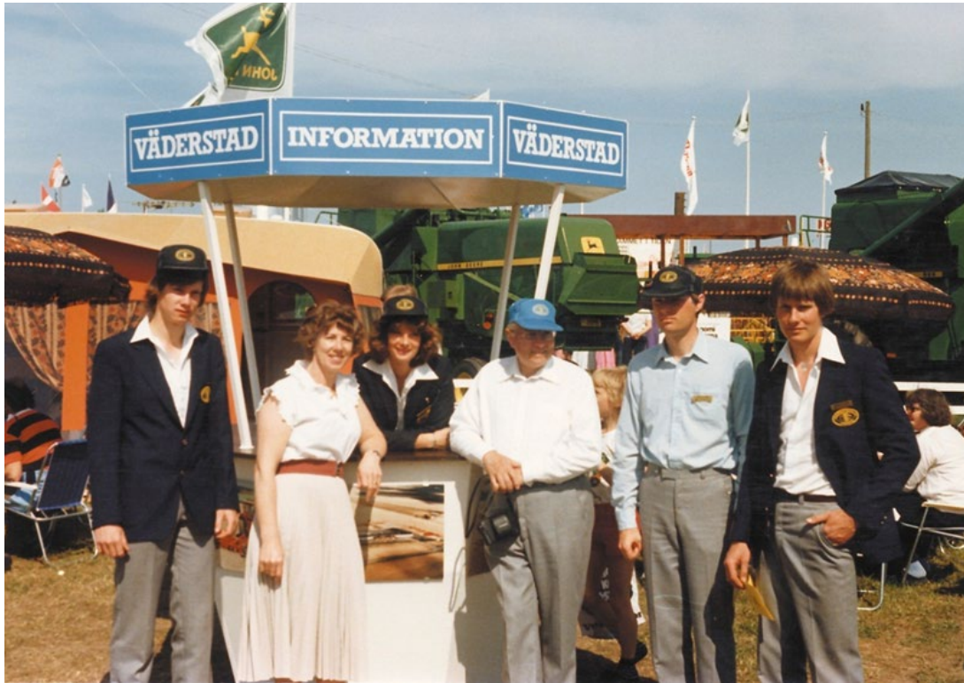
The Stark family 1978